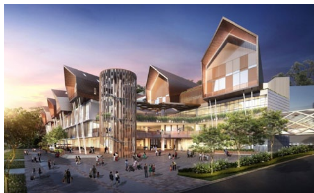
The sculpture will be located at the open plaza of Wisma Geylang Serai, one outdoor and one indoor.

Quoting Senior Minister of State, Ministry of Defence and Ministry of Foreign Affairs, Mayor of South East District, Maliki Osman, "The civic centre was meant for government agencies to come together to integrate certain services for the community. At the same time, (it is) also to ensure that we have a space that envisions to be the hub for the Malay community, to be the pulse of the Malay community, where the heritage of Geylang Serai can be understood by Singaporeans."