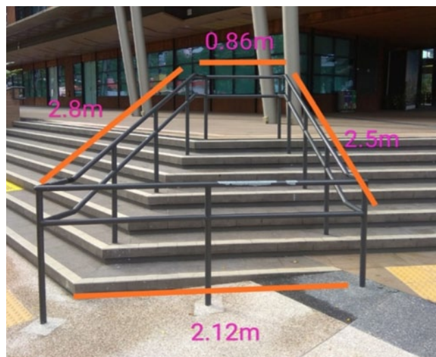
Open Category Site