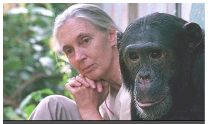
Two winners of the CDL E-Generation Challenge 2020 will win a two-week expedition to Africa and visit Jane Goodall Institute's conservation sites.

Annual competition rescheduled to take place in 2021.